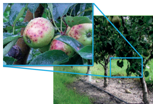
Fruit damage above the black soil